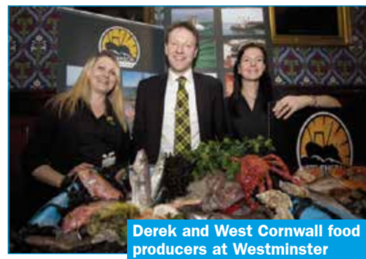
Derek and West Cornwall food producers at Westminster

"There are so many people making high quality products that are perfect for the London market and it was a privilege to introduce London purchasing managers to