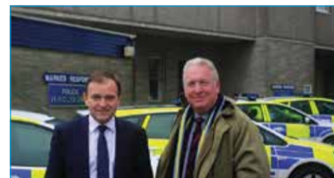
George Eustice with Home Office minister, Mike Penning, outside Camborne Police Station