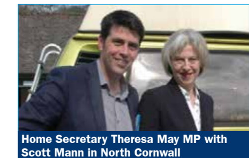
Home Secretary Theresa May MP with Scott Mann in North Cornwall