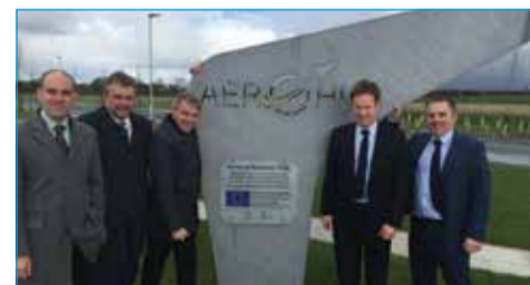
Steve Double welcoming Aviation Minister Robert Goodwill MP to Newquay Aerohub