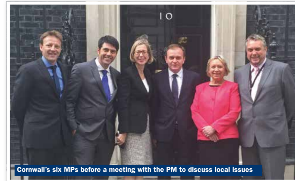
Cornwall's six MPs before a meeting with the PM to discuss local issues