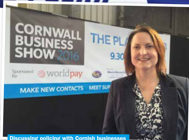
Discussing policing with Cornish businesses

We must continue this work over the next four years – keeping our people safe and giving the police the tools they need to do the job they do so well.