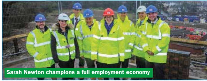
Sarah Newton champions a full employment economy

Unemployment here is already significantly below the UK average and I want this progress to continue. I want to see more home-grown food, home-generated energy and home-made goods and services created here and sold across the UK and the world.